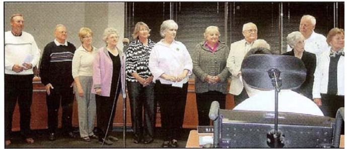
Circle of Grandparents